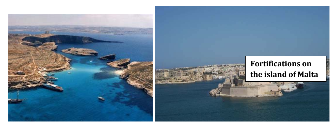
Island of Malta where Paul landed