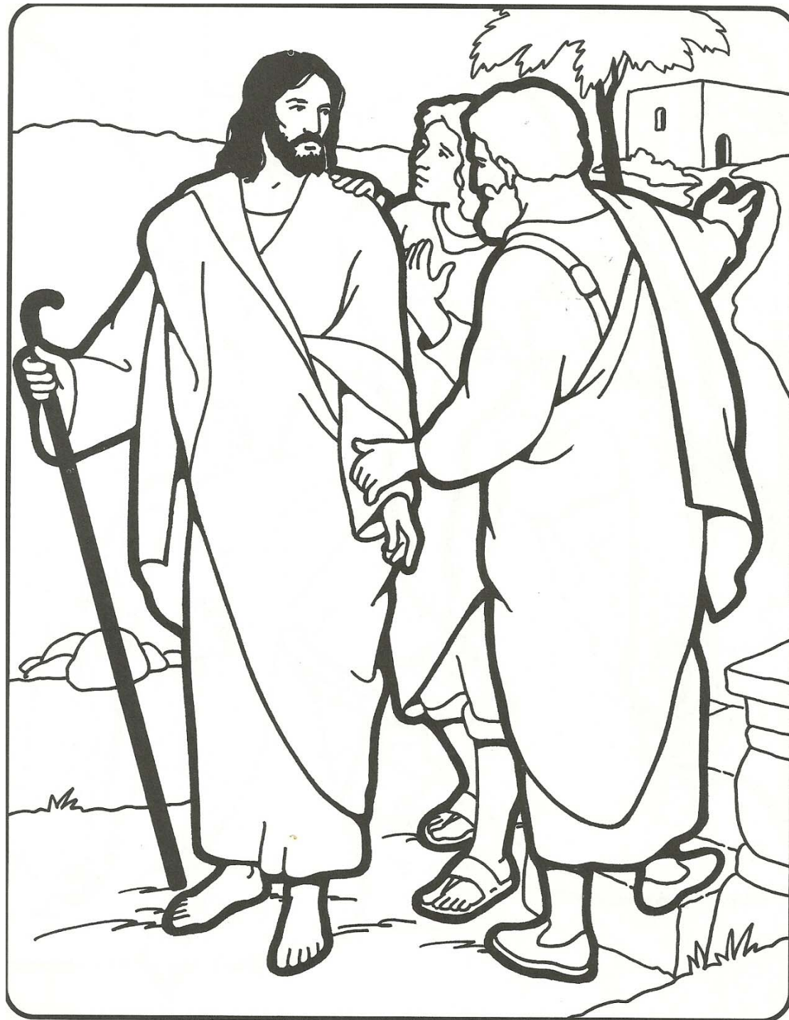
Jesus Calls His Friends – We are Jesus' Friends Too!