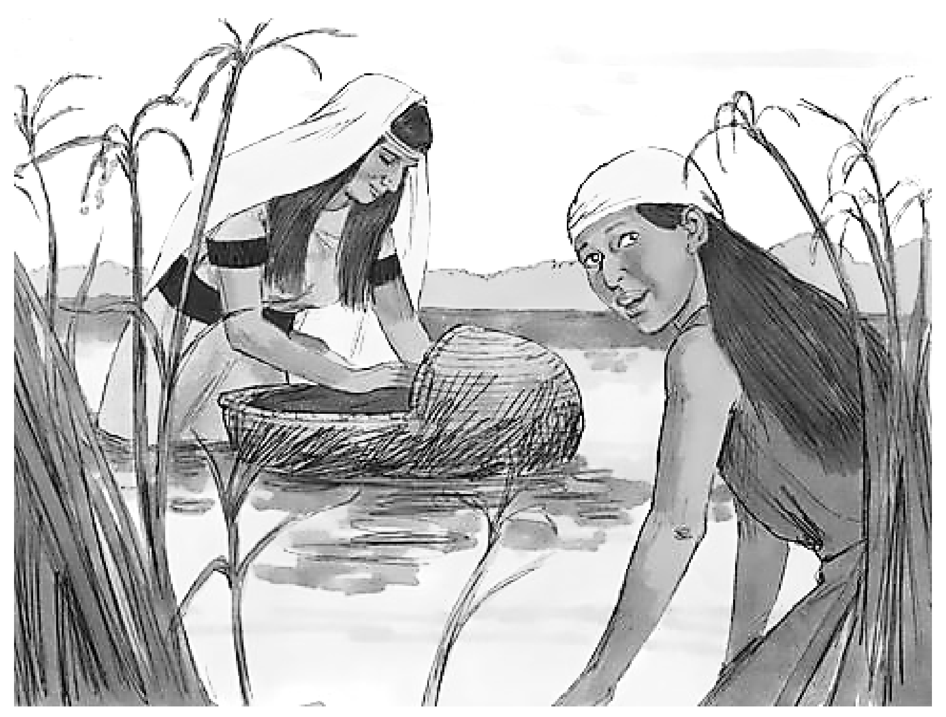
Color the Picture