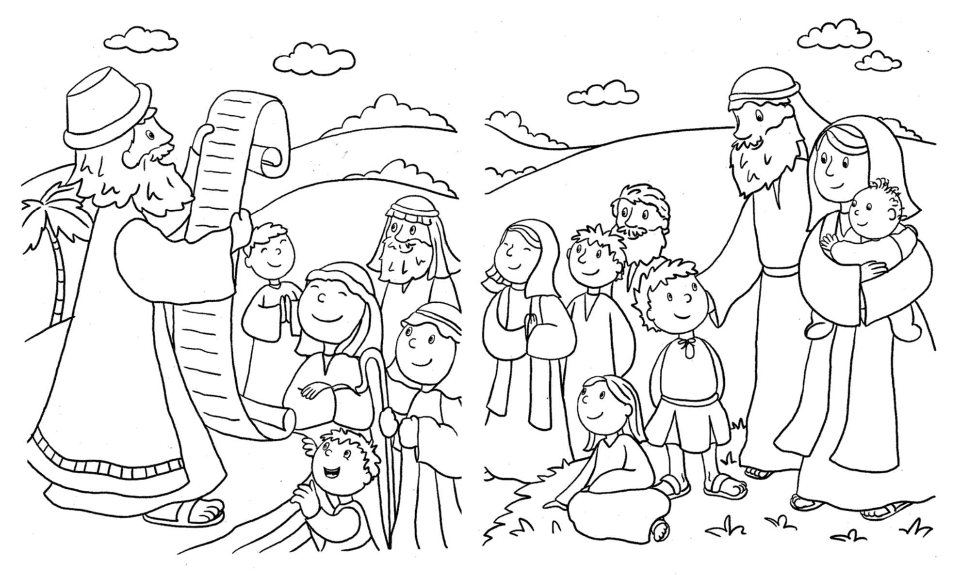
The Bible tells us about God's love.