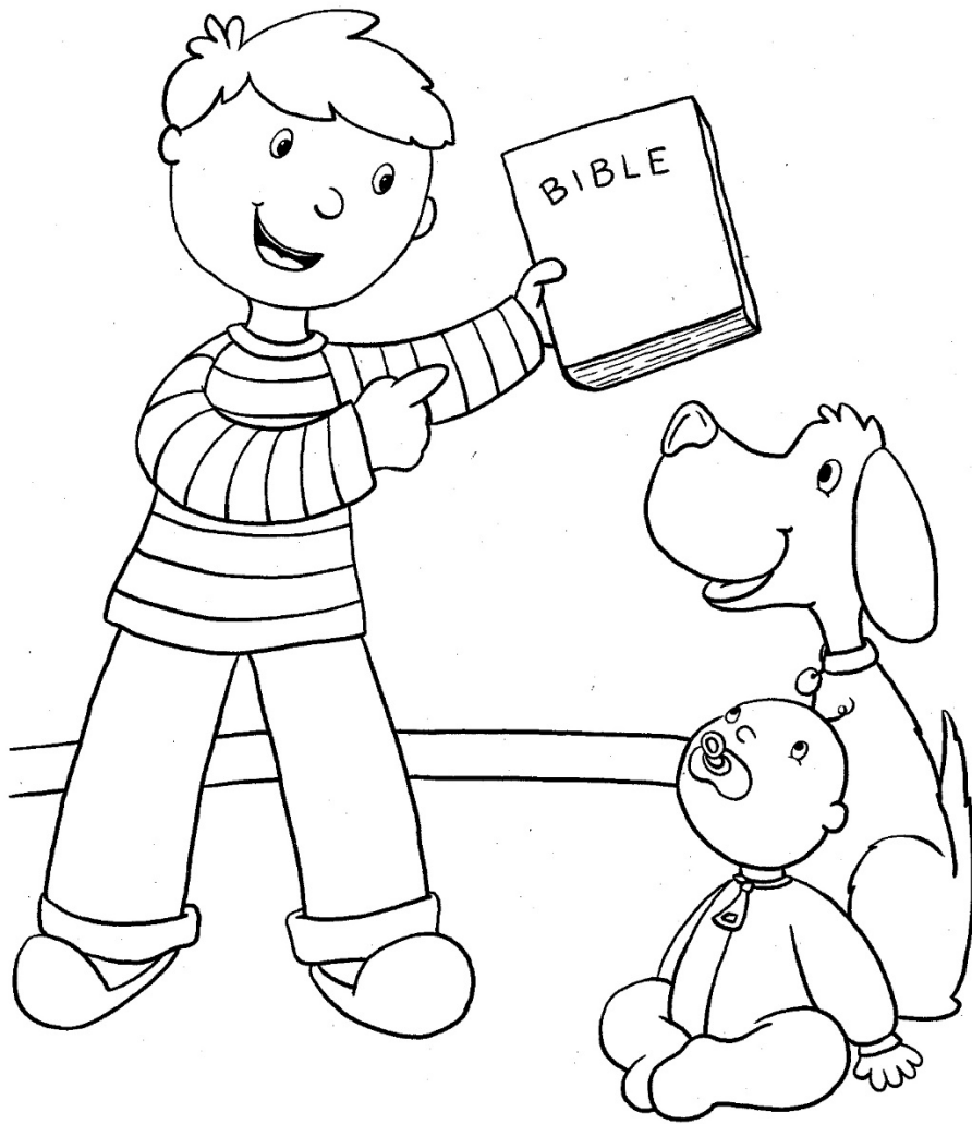
This is my Bible.