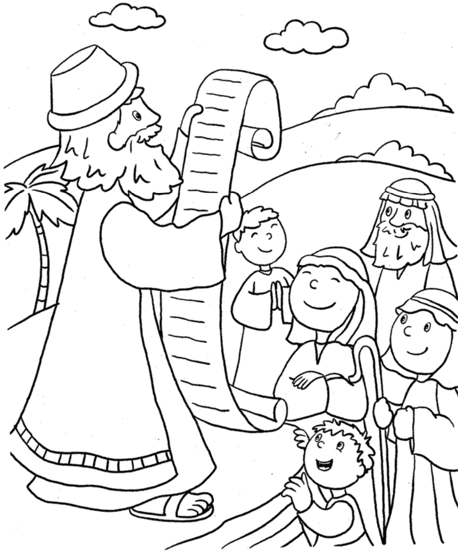
The Bible tells us about God's love.