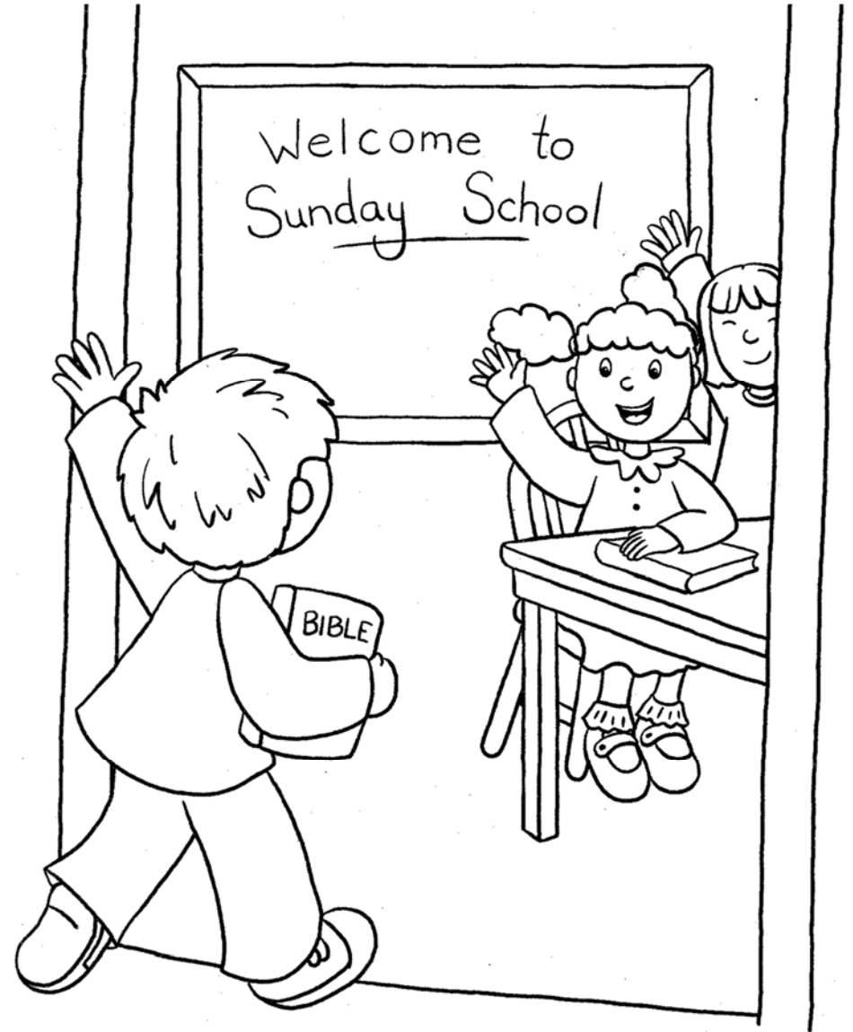
The Bible is God's Word.