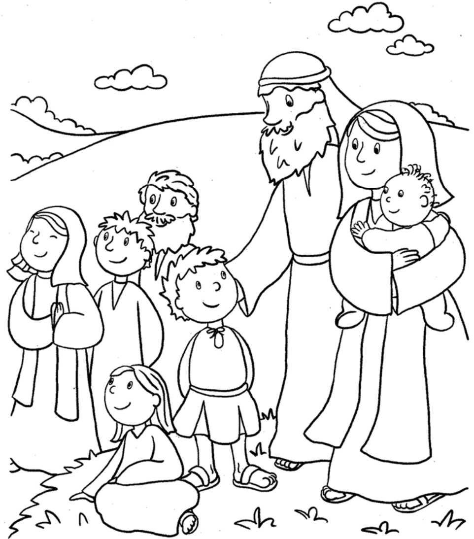
The Bible tells us how to live.

Cut out each picture and the 4 Bibles before class. Have children color the pictures as you read the words and then with their Bible cover craft, put the 4 pictures inside their Bible that is folded and staple or tape the sheets inside the Bible. Then using glue sticks, allow the students to put a small Bible as sticker, one each page, and glue it on the page to remind them that the Bible is God's Word.