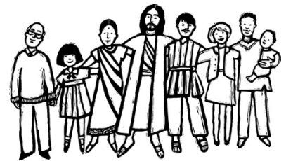
BROTHERS AND SISTERS IN CHRIST

7) We can be thankful for the people in the church because they encourage us!