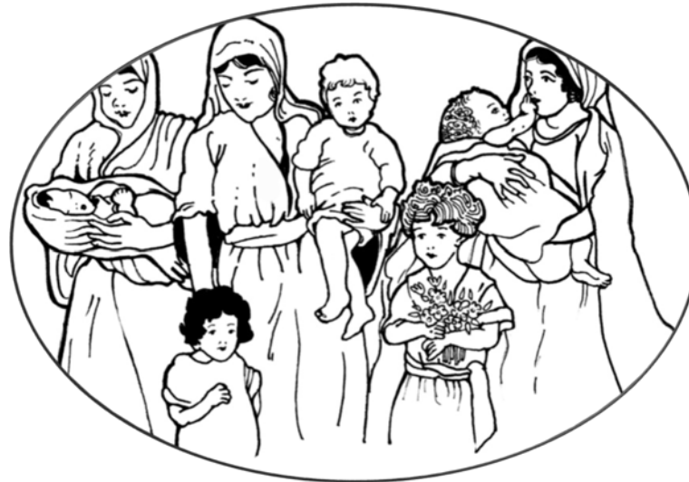
Wives 1 Kings 11:1-13