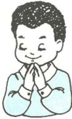
Praying for others