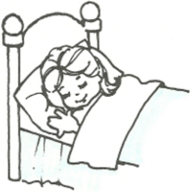
Going to bed on time

Look at the pictures below. Tell how each child might be helping.